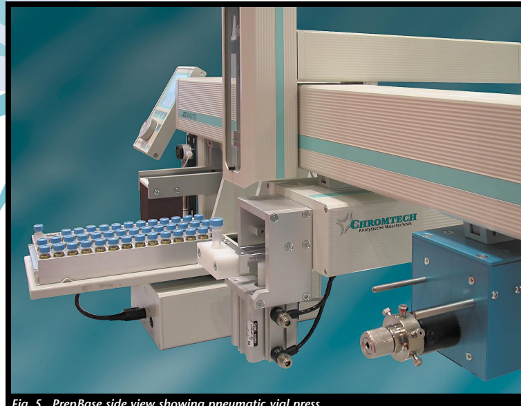
Fig. 5. PrepBase side view showing pneumatic vial press

Improve HPLC Sample Preparation in an Analytical Laboratory – A new, automated sample preparation process (PB401e)