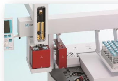
Combi PAL with SPME Fiber & Holder