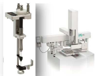
SPME Tool for RTC & RSI PAL

Special offer: 20% discount for a limited time - order now!