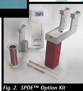
Fig. 2. SPDE™ Option Kit

After adsorption, the syringe picks up carrier gas from the fiber bakeout station (if necessary, the station also is used to dry the coating and syringe). Then, the autosampler moves the syringe over to the hot GC inlet, and the analytes are desorbed. Additional gas flow from the syringe forces the analytes into the inlet, thereby ensuring sharp peak shapes. This technique can be used with splitless flow for maximum sensitivity.