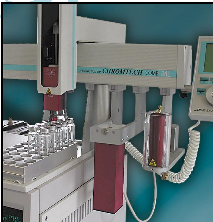
Fig. 1. Combi PAL showing the Single Magnet Mixer (SMM) and purge station

A gas-tight 2.5 mL syringe is equipped with a special needle that is coated on the inside with an extraction phase. The phase can be applied in variable thicknesses. The adsorption process is best described as follows: A liquid or headspace sample is drawn up into a 2.5mL syringe, thereby adsorbing analytes onto the stationary phase. A distribution balance is reached between the liquid sample matrix and the active phase. The analytes are concentrated onto the phase by repeatedly moving the plunger up and down, thereby forcing the headspace or fluid through the needle. Fast plunger speeds ensure a quick exchange of sample near the active phase.