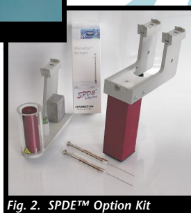
Fig. 2. SPDE™ Option Kit

After adsorption, the syringe picks up carrier gas from the fiber bakeout station (if necessary, the station also is used to dry the coating and syringe). Then, the autosampler moves the syringe over to the hot GC inlet, and the analytes are desorbed. Additional gas flow from the syringe forces the analytes into the inlet, thereby ensuring sharp peak shapes. This technique can be used with splitless flow for maximum sensitivity.